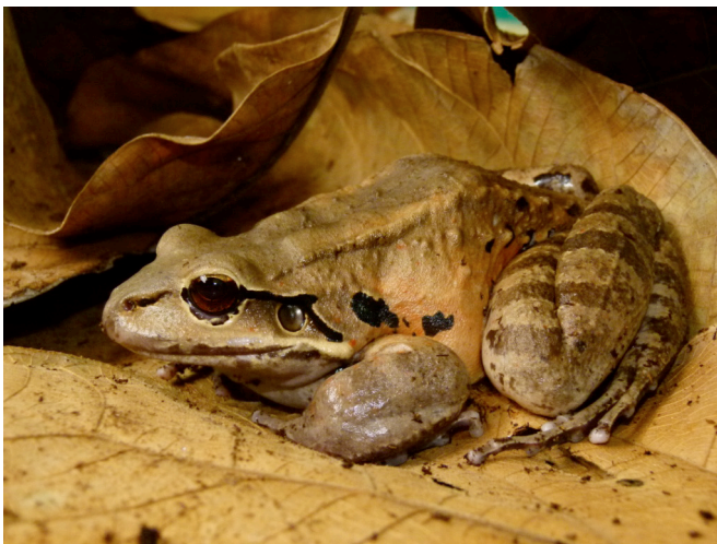
Figure 1. The mountain chicken ( Leptodactylus fallax )

D ominica was once the stronghold of one of the giants amongst frogs: the mountain chicken ( Leptodactylus fallax ). L. fallax is the largest amphibian in the Caribbean region (Fig. 1), and is currently listed as Critically Endangered by the IUCN (Fa et al., 2013). Currently, L. fallax is restricted to the islands of Dominica and Montserrat in the Eastern Caribbean; it was formerly far more widespread, occurring on seven Eastern Caribbean islands (Schwartz & Henderson, 1981). Island extinctions came about through a combination of habitat loss (forest and freshwater), introduced predators (especially rats and mongoose) and over-exploitation for food.