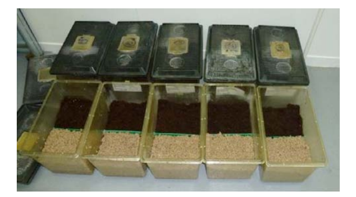
Figure 1. Choice chambers used to assess substrate preference in G. seraphini , with Megazorb to the front of each chamber and coir to the rear.

The position of each caecilian was recorded once every day between 09:00 and 16:00 hrs by gently lifting the choice chamber. Location could be established mostly without disturbing animals because parts could usually be seen through the clear base and/or sides of the chamber. Otherwise the position of each caecilian had to be established by sifting through the substrate in the choice chamber by hand. A control was not deemed appropriate in this study because health issues had been observed in animals that had been provided coir as a substrate. Because Megazorb had not previously been used as a substrate for caecilians it was not considered appropriate to house them on this substrate alone. The experiment ended after 39 days, on the ninth of February 2014, the G. seraphini were weighed and two separate groups transferred to enclosures with a Megazorb substrate.